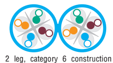
Diagram scale approx. 2:1