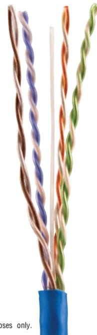
Photo is for representation purposes only.